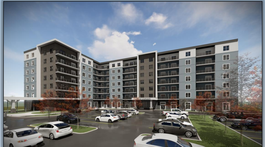
Building B Seniors Apartments