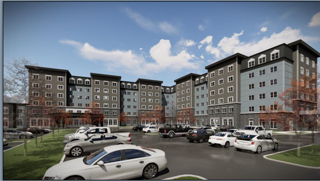
Building A Retirement Home