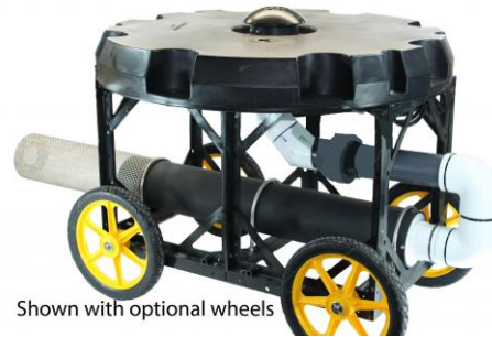
Shown with optional wheels